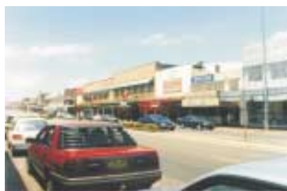
Fig. 1 Taree, before adaptation (November, 1997)

The Main Streets of rural towns, and most sub-arterial roads, not only perform a traffic function, but also provide access to the activities along their frontage. Increased traffic has accentuated two major problems. One, the priority in the traffic function is impeded by the activities along the frontage - particularly in areas where there are high levels of parking turnover or many parking manoeuvres, turning movements and crossing pedestrians. Two, the activities along the frontage suffer from the impact of traffic noise and vehicular pollution, access to sites and difficulties for pedestrians who want to cross.