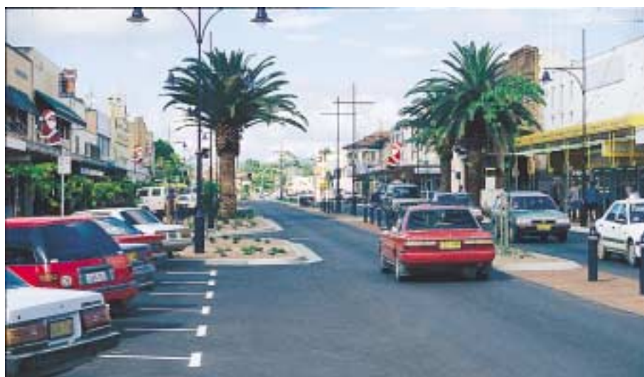
Fig. 2 Taree, one year later (November 1998)

‘Sharing the Main Street’ requires an understanding of, and support by, the people and organisations affected (the ‘stakeholders’), collaboration between different disciplines, and arrangements for implementation that may involve different government agencies.