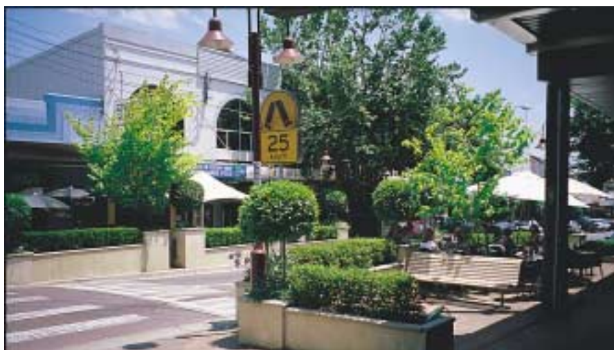
Figure 3 Environmental adaptation, Crows Nest.

The information contained in the various Parts is intended to be used as a guide to good practice. It is generally consistent with the Guide to Traffic Engineering Practice (Austroads, 1988), RTA Technical Directions and RTA Guidelines for Local Area Traffic Management Facilities.