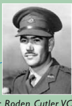
Sir Roden Cutler VC